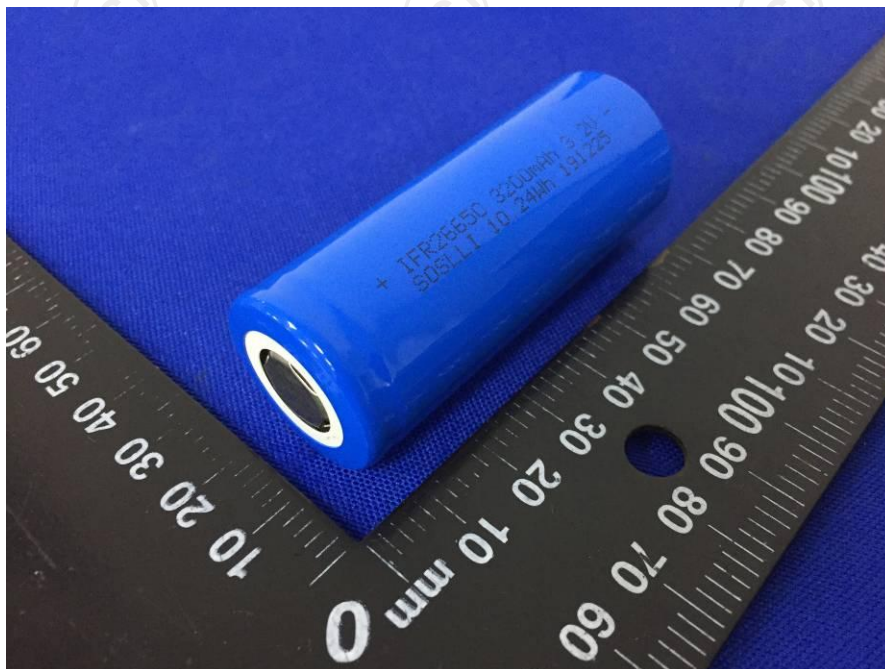
Picture 1. Cell view