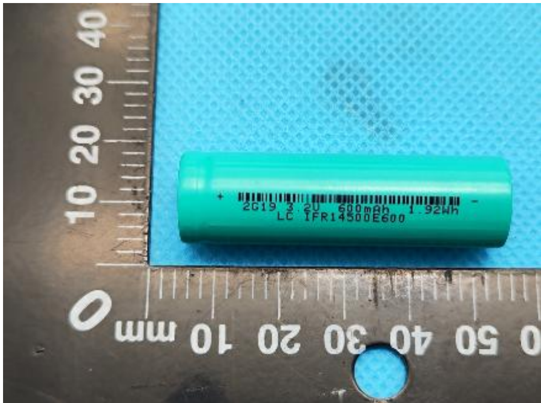
Cell /电芯 (IFR14500E600 3.2V 600mAh 1.92Wh)